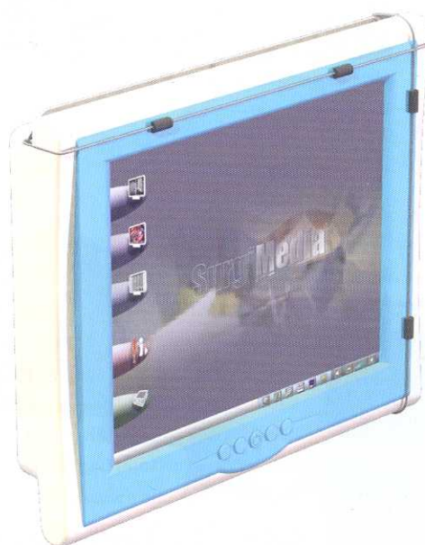
SurgiMedia is a centralised digital display station that allows any kind of patient data to be brought into the operating theatre

ISIS was founded in 2002 and launched its SurgiAssist in 2004, its